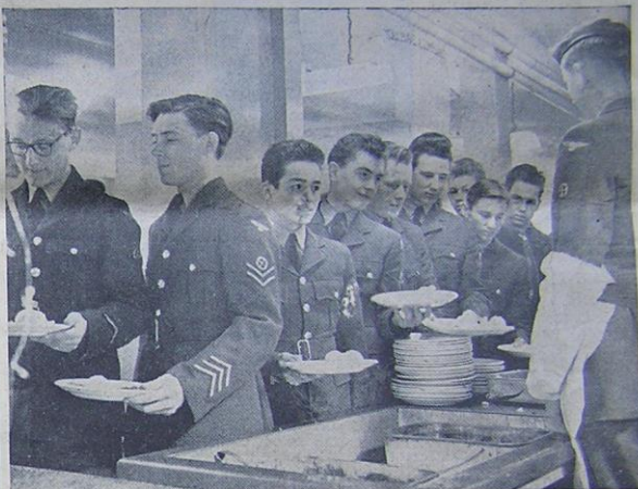
A GROUP OF NORFOLK BOYS TAKING THE APPRENTICESHIP COURSE QUEUE FOR LUNCH IN THE MESS HALL.